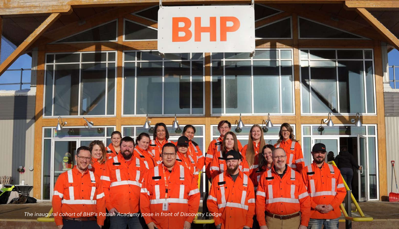
The inaugural cohort of BHP's Potash Academy pose in front of Discovery Lodge