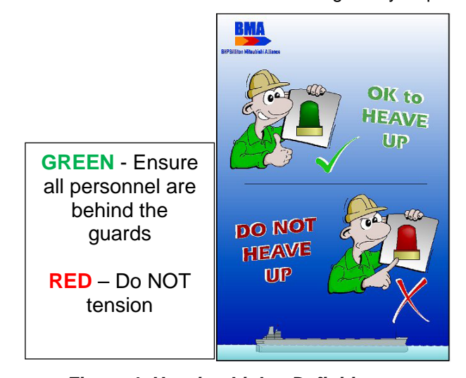
Figure 4: Heaving Lights Definition

26 Vessel Anchors are to be locked using a suitable latching / locking mechanism to prevent the anchor from being dropped onto the lines boat. The lines boat master will seek confirmation that the anchor locks are in place prior to approaching the vessel.