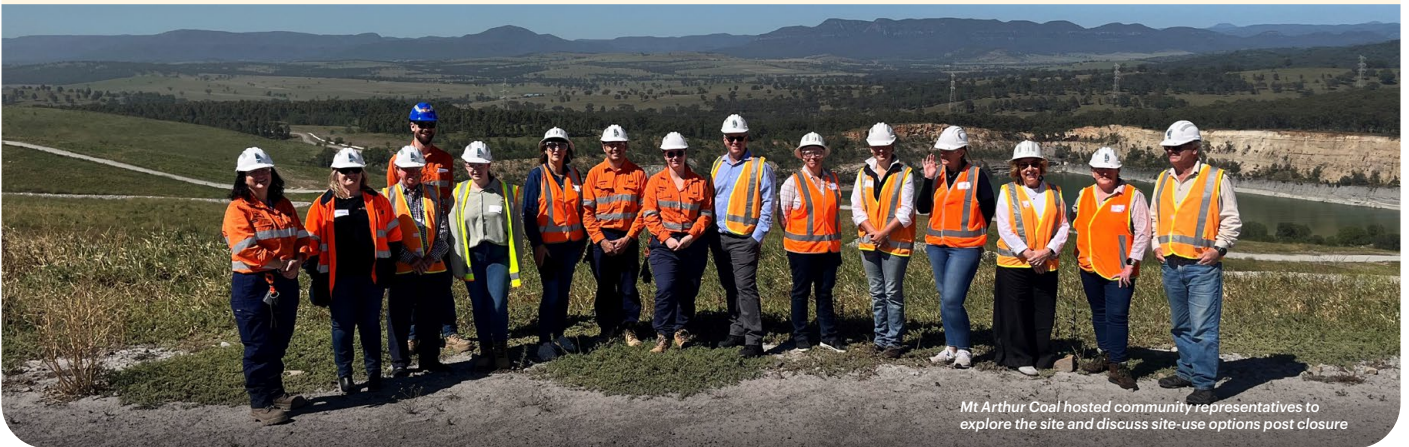
Mt Arthur Coal hosted community representatives to explore the site and discuss site-use options post closure