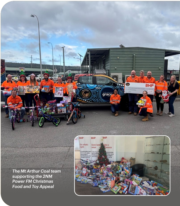
The Mt Arthur Coal team supporting the 2NM Power FM Christmas Food and Toy Appeal

The Appeal is only possible thanks to the hard work of dedicated volunteers at Blackroo Community Indigenous Corporation, who coordinate the collection and distribution of donations, and the many volunteers from Muswellbrook community including members of the Mt Arthur Coal team. Thank you to all the volunteers who once again chipped in to create a bit of Christmas magic.