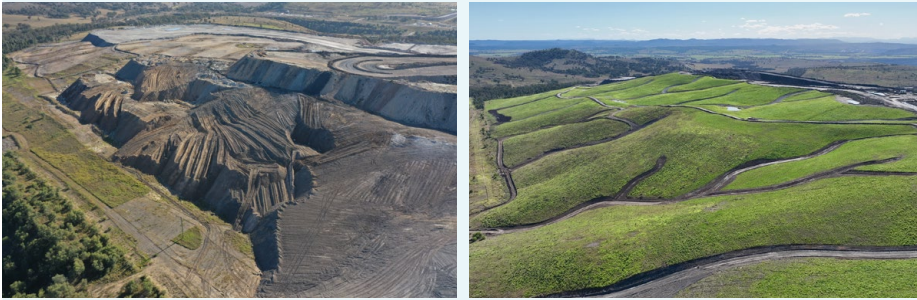
Landform before and after alluvial shaping

Mt Arthur Coal has continued to deliver on its commitment to leaving a positive environmental legacy, partnering with Robson Civil Projects to deliver award-winning land rehabilitation and maintenance works.