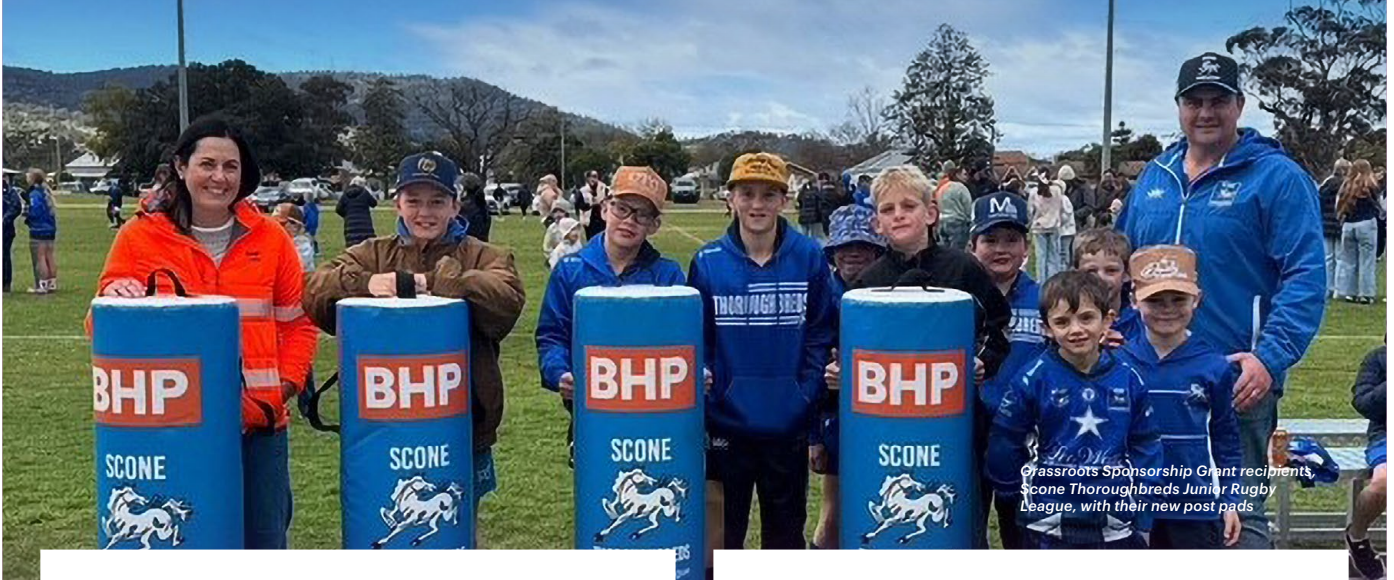
Grassroots Sponsorship Grant recipients, Scone Thoroughbreds Junior Rugby League, with their new post pads

We provide grants to community organisations through two separate programs: our Benefiting My Community program and our Grassroots Sponsorship Grants.