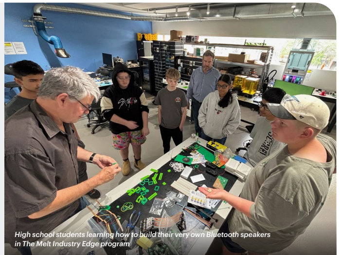
High school students learning how to build their very own Bluetooth speakers in The Melt Industry Edge program

By supporting the next generation interested in pursuing STEM careers and entrepreneurship, programs such as these continue to shape future industries within the region.