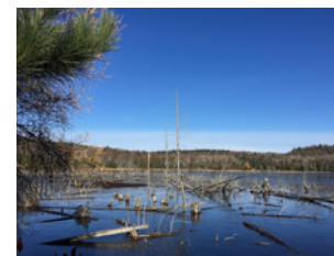
Restored habitat surrounding Elliot Lake, Ontario