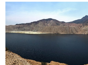
Former Copper Cities Copper Mine, Arizona