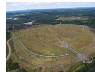
Reclaimed mine site in Selbaie and Poirier, Quebec