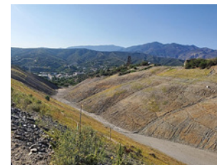
Former tailings pile for Miami Unit Copper Mine, Arizona