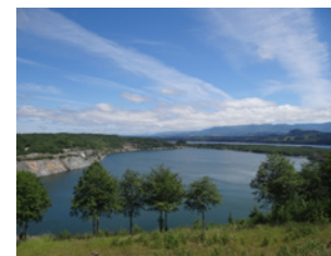
Island Copper, British Columbia