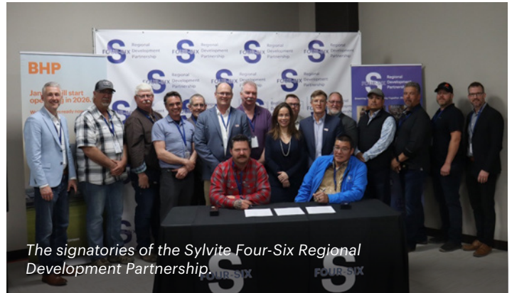
The signatories of the Sylvite Four-Six Regional Development Partnership.

S4-6 includes regional representatives including Indigenous groups, urban and rural municipalities, and the Mid Sask Municipal Alliance with support from BHP.