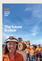
Annual Report 2021