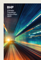
Climate Transition Action Plan 2021