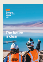
Economic Contribution Report 2021