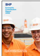
Economic Contribution Report 2020

If you would like further information or would like to change your previous election in relation to electronic or hard copy communications, please contact: