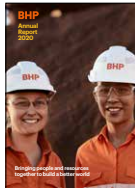
Annual Report 2020