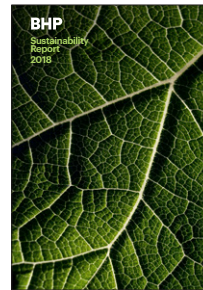
Sustainability Report 2018

The Sustainability Reporting Navigator 2018 indicates the sections of BHP's Sustainability Report 2018, Annual Report 2018, Economic Contribution Report 2018, Water Report 2018 and Climate Change: Portfolio Analysis Report that specifically address what we have done to address the GRI guidelines and uphold the 10 principles of the International Council on Mining and Metals and the United Nations Global Compact. The BHP Sustainability Report 2018 also serves as our Advanced Level Communication on Progress for the UN Global Compact.