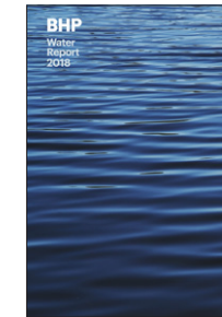
Water Report 2018