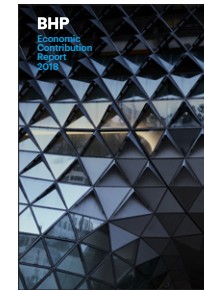
Economic Contribution Report 2018