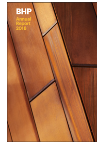
Annual Report 2018