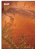
Annual Report 2017