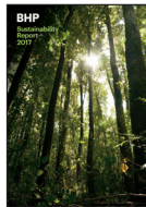
Sustainability Report 2017