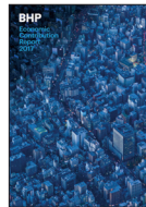
Economic Contribution Report 2017

If you would like further information or would like to change your previous election in relation to electronic or hard copy communications, please contact: