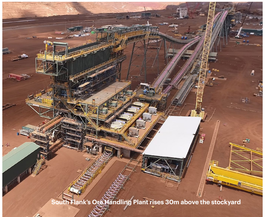
South Flank's Ore Handling Plant rises 30m above the stockyard

Around 9000 direct and indirect jobs have been created during construction and more than 600 ongoing operational roles will be required during the life of the mine.