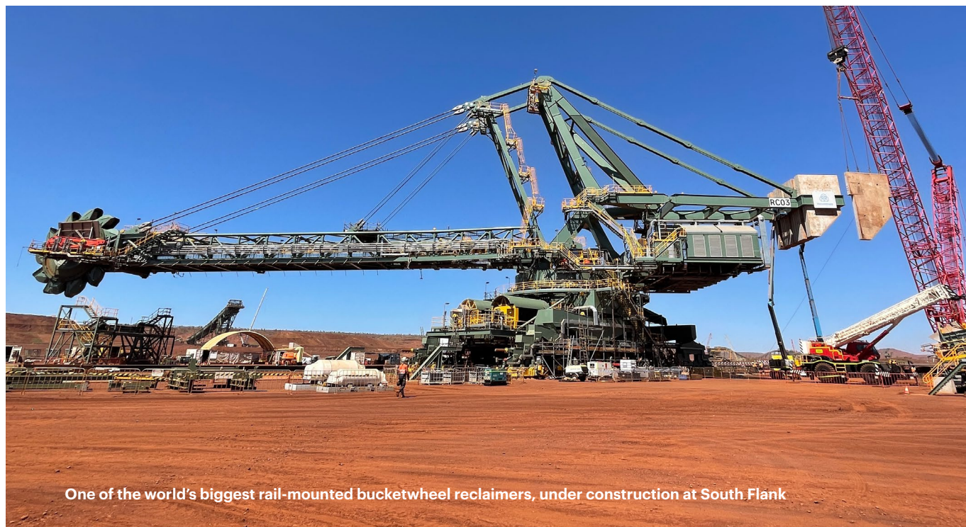
One of the world's biggest rail-mounted bucketwheel reclaimers, under construction at South Flank

Finally, ore from South Flank will enhance the average quality of BHP's production in Western Australia, adding value by helping to lift the average iron grade from ~61 per cent to ~62 per cent, and the overall lump yield from ~25 per cent to ~30-33 per cent.