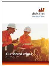
Sustainability Report 2013

The Sustainability Reporting Navigator 2013 indicates the sections of BHP Billiton's Sustainability Report, Annual Report and Summary Review that specifically address what we have done to address the GRI guidelines and uphold the 10 principles of the International Council on Mining and Metals and the United Nations Global Compact.