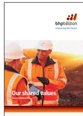
Summary Review 2013