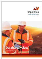
Annual Report 2013