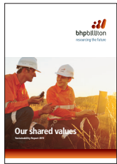
Sustainability Report 2013

The Sustainability Reporting Navigator 2013 indicates the sections of BHP Billiton's Sustainability Report, Annual Report and Summary Review that specifically address what we have done to address the GRI guidelines and uphold the 10 principles of the International Council on Mining and Metals and the United Nations Global Compact.