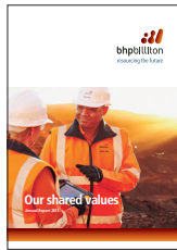
Annual Report 2013