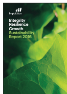
Sustainability Report 2016