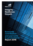
Economic contribution and payments to governments Report 2016

If you would like further information or would like to change your previous election in relation to electronic or hard copy communications, please contact: