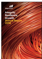
Annual Report 2016

BHP Billiton produces a range of publications that can be viewed or downloaded at www.bhpbilliton.com . You can also elect to receive a paper copy of the Annual Report through the Share Registrar.