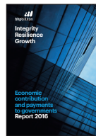
Economic contribution and payments to governments Report 2016

If you would like further information or would like to change your previous election in relation to electronic or hard copy communications, please contact: