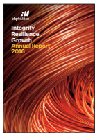
Annual Report 2016

BHP Billiton produces a range of publications that can be viewed or downloaded at www.bhpbilliton.com . You can also elect to receive a paper copy of the Annual Report through the Share Registrar.