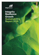
Sustainability Report 2016