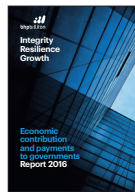
Economic contribution and payments to governments Report 2016

If you would like further information or would like to change your previous election in relation to electronic or hard copy communications, please contact: