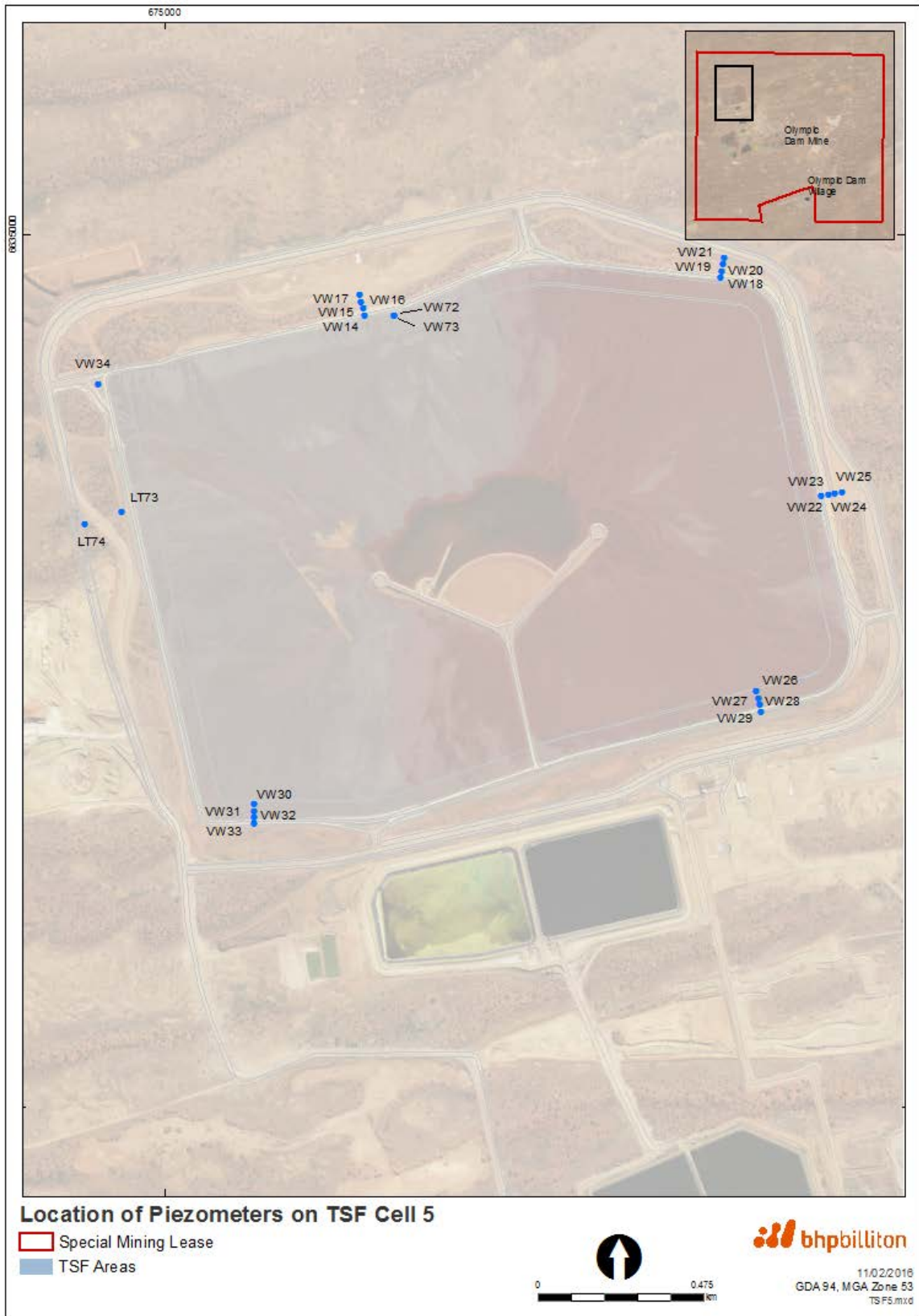
Figure 2-2: Location of piezometers on TSF Cell 5 East