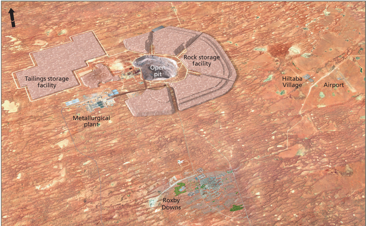
AT 40 YEARS