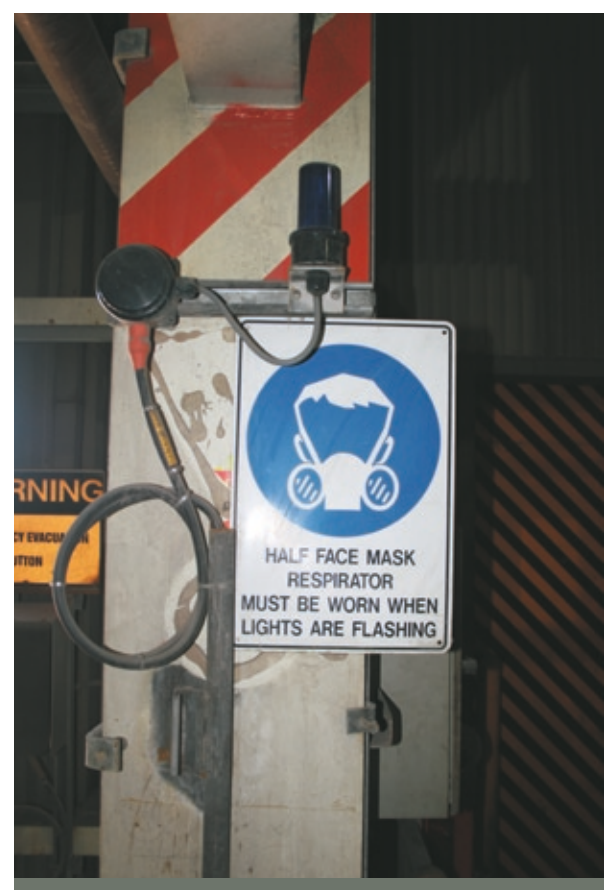
Plate 22.5 Safety Management System – personal protective equipment procedure

Detailed contingencies for key project risks will be determined in more detail during the subsequent stages (Definition and Execution stages) of the project. The outcomes of the EIS risk