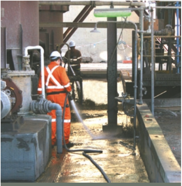
Plate 22.9 Bunding, safety shower and clean up at Olympic Dam

Protecting the health and safety of employees, contractors and the general public is an overriding commitment of the BHP Billiton Group and the Olympic Dam operation.