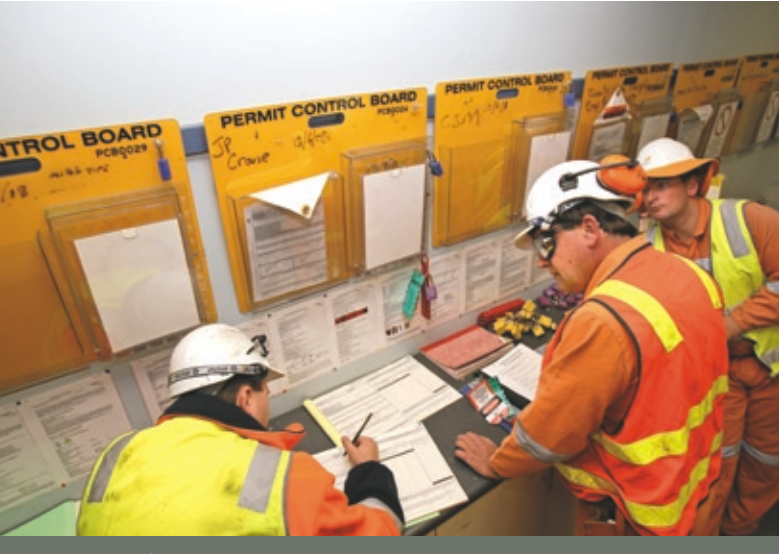
Plate 22.1 Safety Management System – permit to work