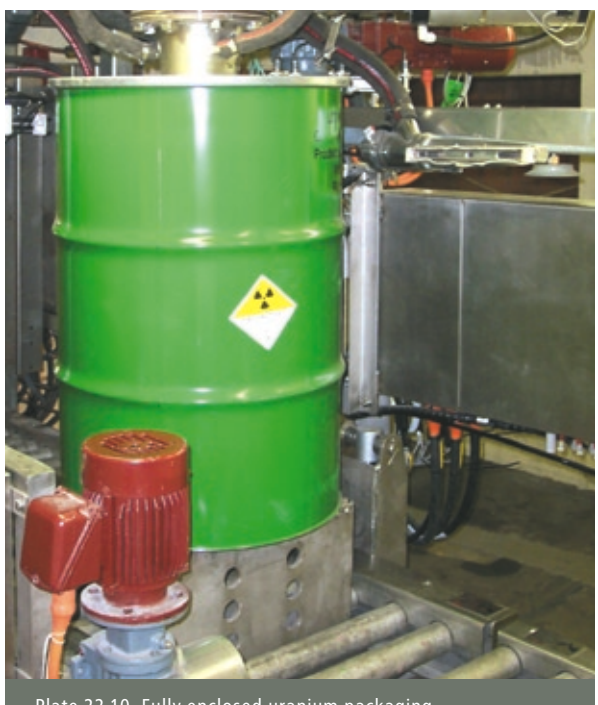
Plate 22.10 Fully enclosed uranium packaging

At this stage of the proposed expansion, the most effective means of managing potential health and safety issues is to instil good health and safety criteria into the project design.