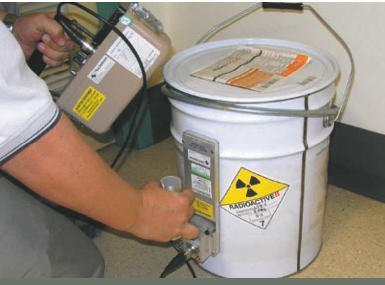
Plate 22.15 Metallurgical samples being checked for contamination prior to shipment

Further details on dose assessment for employees are presented in Appendix S2.