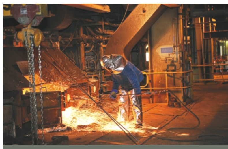
Plate 22.2 Engineered fume extraction and personal protective equipment used by a smelter tapper