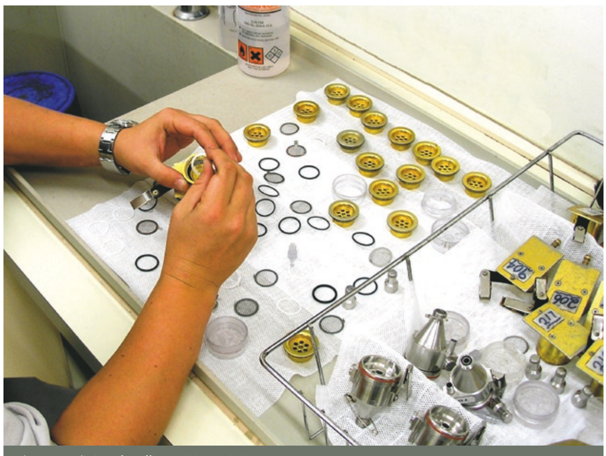
Plate 22.3 Radiation safety officer servicing monitoring equipment

In the mine, the average dose to full-time underground workers, between 2001 and 2007, was 3.5 mSv/y. The most highly exposed work group received an average of 5.9 mSv/y, while the highest individual dose in any year was 9.9 mSv (compared to the applicable limit of 20 mSv).