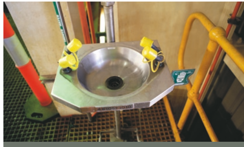
Plate 22.6 Eye wash station

The metallurgical plant has high temperature processes and uses various flammable substances which could lead to fires. Management of the fire risk depends on the particular hazard. In the smelter, good design is required to contain heat and control flows of molten metal. In the solvent extraction area, there are very large quantities of flammable liquids which require specific controls, such as grounding to dissipate static electricity, designs to enable quick release and draining of liquid in the event of a fire and foam deluge fire suppression systems.