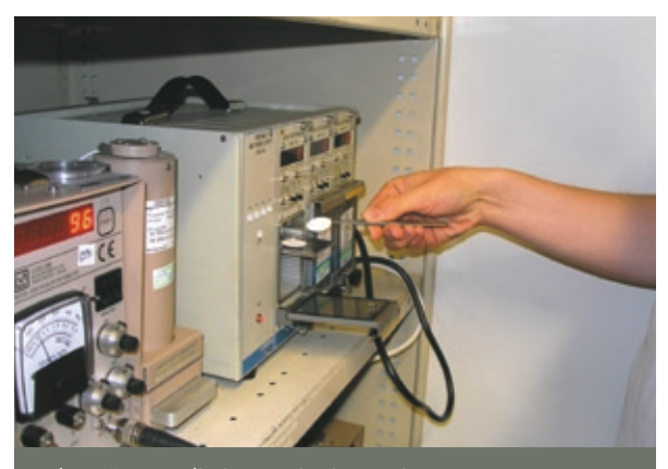
Plate 22.14 Radiation monitoring equipment

In addition to complying with dose limits, a key principle of radiation protection (as defined by the ICRP) is ensuring that radiation exposures are as low as reasonably achievable. The ICRP calls this 'optimisation' and it is known as 'the ALARA principle' in which ALARA means 'As Low as Reasonably Achievable' (social and economic factors taken into account). The radiological assessment of the proposed expansion has