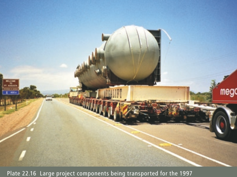
Plate 22.16 Large project components being transported for the 199. Olympic Dam expansion