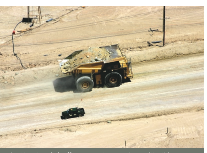
Plate 22.12 Controlled traffic movements in open pit in Escondida, Chile