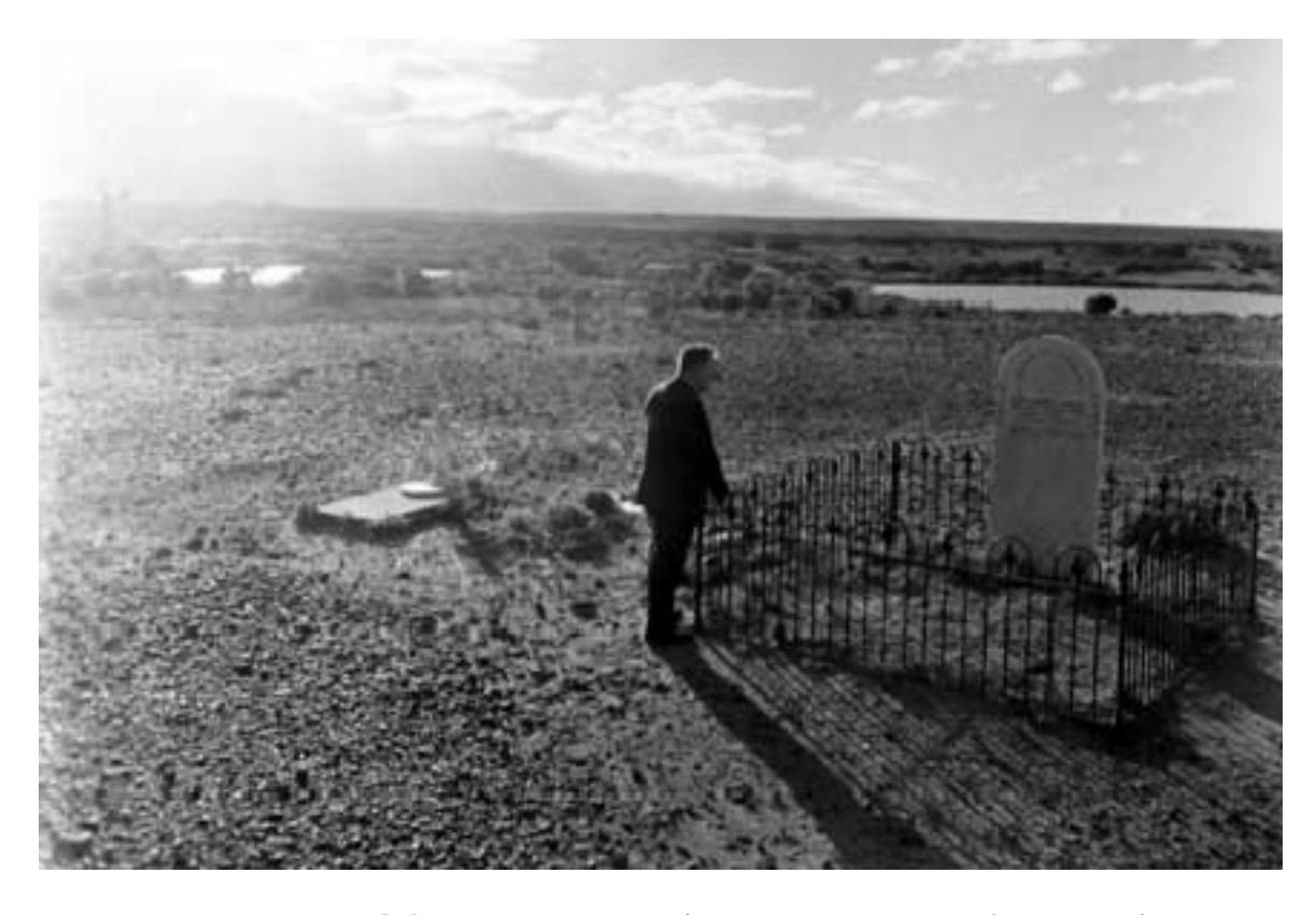
Graves at Phillips Ponds, 1956