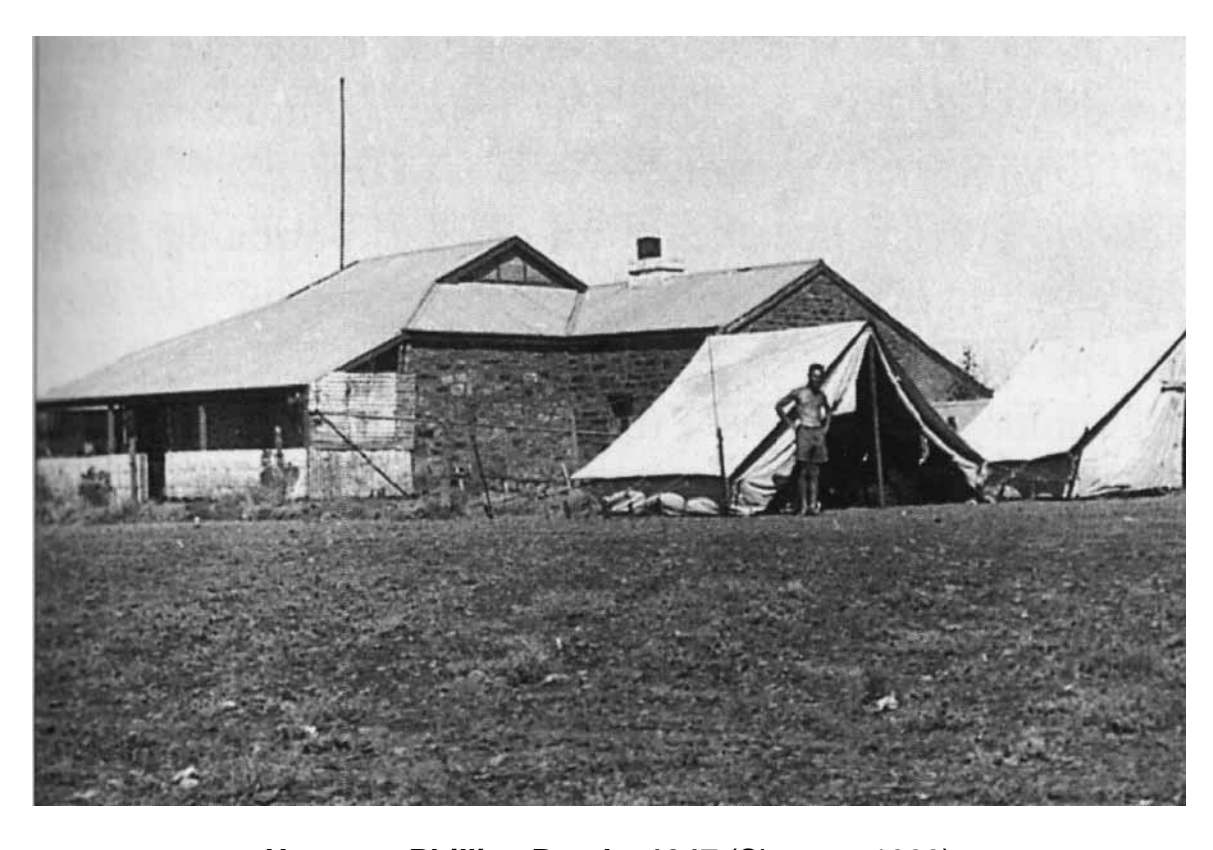
House at Phillips Ponds, 1947 (Showers 1999)