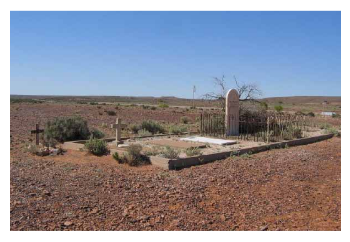
Graves at Phillips Ponds, 2006 (Yvette Mooney)