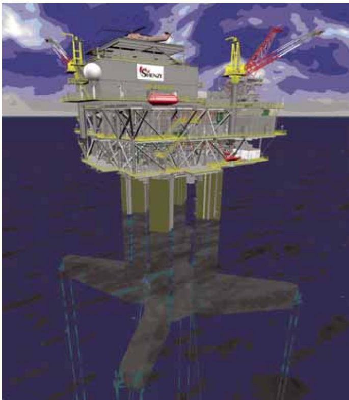
An artist's rendering of the Shenzi Tension Leg Platform.

In the Gulf of Mexico, BHP Billiton is one of the few operators of oil and gas production facilities to earn ISO 14001 certification, which was renewed in May 2006. Also in May 2006, the company was re-certified for OHSAS (Occupational Health Safety and Standard) 18001 certification, which recognizes that the company has implemented policies and procedures to help minimize health and safety risks to employees and other persons.