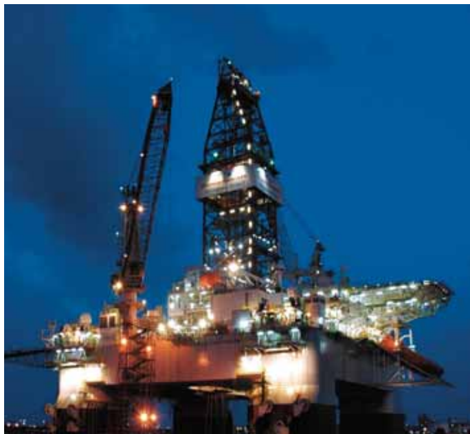
The GSF Development Driller I, on contract to BHP Billiton through mid-2008, was specifically designed for deepwater drilling activities. It includes 18,000 square feet of useable deck space and more than 7,000 metric tons of variable deck load.

A standalone, tension leg platform (TLP) has been selected by the joint venture partners to develop the hydrocarbon reserves at Shenzi. The facility will have a nominal capacity to produce up to 100,000 barrels of oil per day and up to 50 million cubic feet of gas per day. The proposed facilities, wells, and completions are proven designs that have been successfully implemented in the deepwater Gulf of Mexico. The TLP design is a Modec International "Moses" class platform, similar to that used on the Marco Polo field, which is also located in the deepwater Central GoM and is operated by Anadarko.