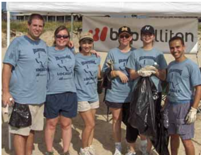
BHP Billiton employees regularly volunteer in beneficial community activities throughout the year, such as an annual clean up of beaches on the Gulf Coast, as pictured above.

Drilling and completion operations will be executed using the drillship GSF C.R. Luigs and the GSF Development Driller 1 , a newly built and commissioned ultra-deepwater semi-submersible drilling rig. BHP Billiton signed a two-year contract with the drilling contractor GlobalSantaFe for the use of this rig in the GoM in 2004. The DDI is being designed to meet the requirements of drilling in challenging deepwater environments and has been optimized for development drilling and subsea completion projects. It was delivered to BHP Billiton for use on the Neptune field in 2006.