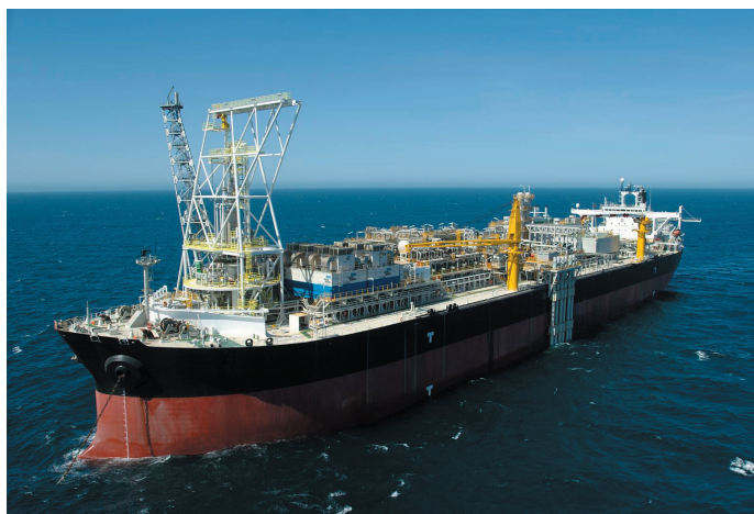
A Floating Production Storage and Offtake (FPSO) facility

BHP Billiton has operated six FPSOs during the past 22 years.