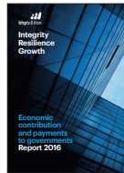
Economic contribution and payments to governments Report 2016

If you would like further information or would like to change your previous election in relation to electronic or hard copy communications, please contact: