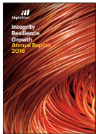
Annual Report 2016

BHP Billiton produces a range of publications that can be viewed or downloaded at www.bhpbilliton.com . You can also elect to receive a paper copy of the Annual Report through the Share Registrar.