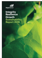
Sustainability Report 2016